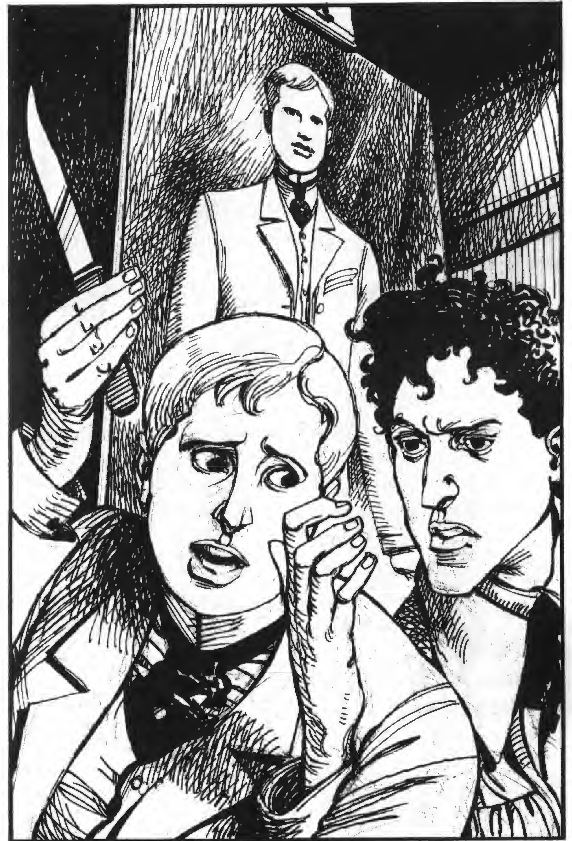
‘Don’t, Basil!’ he cried. ‘Don’t murder it!’

‘Well, you and I will go together, Mr Gray.’